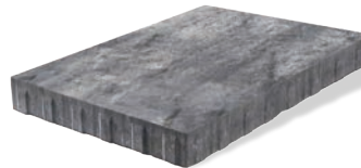
XL UNIT 21 x 35 x 2 3/8" 540 x 900 x 60mm