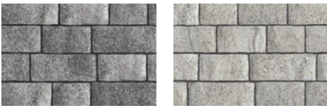
CRYSTALLINE BASALT PEPPERED GRANITE