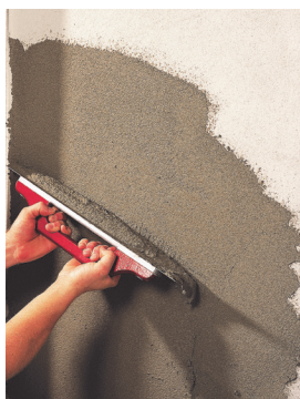
ARDEX AM 100™ Install waterproofing in approximately 2 hours