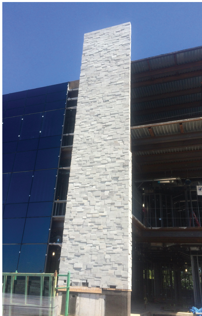
Top down installation with ARDEX X 77™ without mechanical supports

ARDEX Natural Stone Veneer System Installations with ARDEX high-performance products are backed by the industry best comprehensive 10 year ARDEX SystemOne™ Warranty.