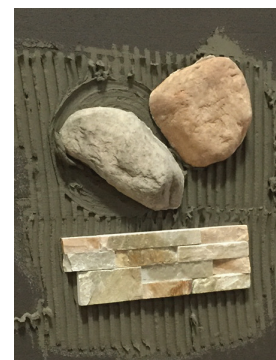
ARDEX X 77™ 20 to 30 minute adjustment time