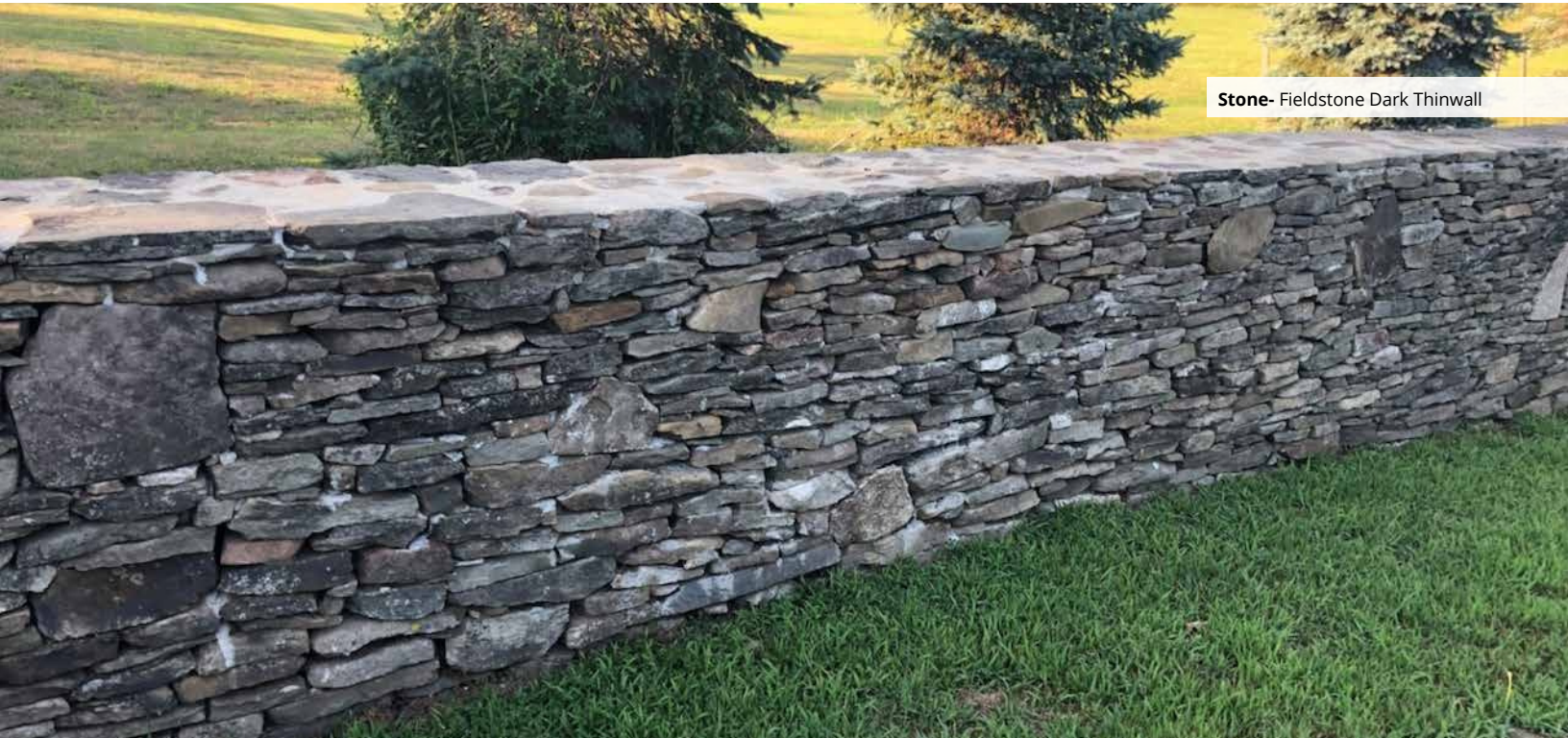
Stone- Fieldstone Dark Thinwall